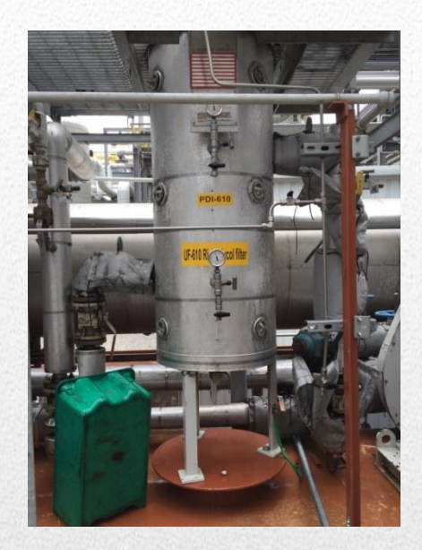
Existing Carbon Vessel