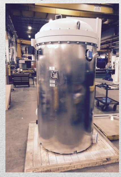
Recently Shipped Hilco Manufactured Carbon Vessel

Depending on the specific geographical area of production, natural gases such as ethane, propane, and butane can contain significant quantities of hydrogen sulfide (H<sub>2</sub>S). The H<sub>2</sub>S content in the gas needs to be < 5 ppm before it is transferred to the pipeline company. H<sub>2</sub>S is removed by the midstream gas processor by "scrubbing" through a glycol reactor. The H<sub>2</sub>S is removed from the glycol by utilizing this activated carbon cartridge.