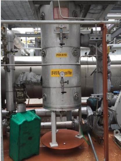
Existing Carbon Vessel