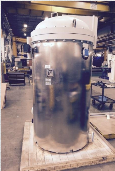
Recently Shipped Hilco Manufactured Carbon Vessel

Depending on the specific geographical area of production, natural gases such as ethane, propane, and butane can contain significant quantities of hydrogen sulfide ( H_2S ). The H_2S content in the gas needs to be < 5 ppm before it is transferred to the pipeline company. H_2S is removed by the midstream gas processor by “scrubbing” through a glycol reactor. The H_2S is removed from the glycol by utilizing this activated carbon cartridge.